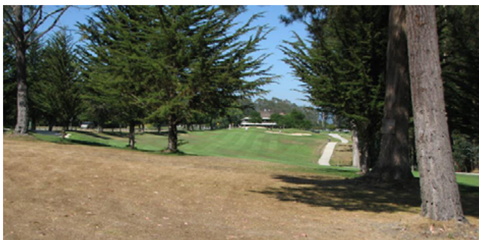
During a drought emergency, the greatest amount of water saving will be achieved by reducing water applications on larger areas of the property, such as the rough.