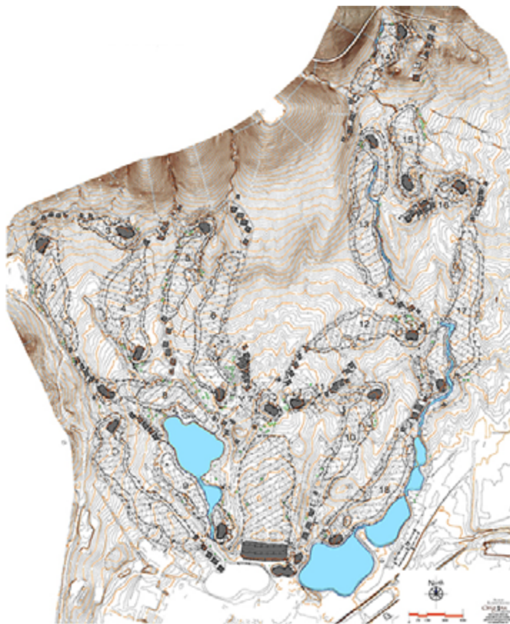
An accurate map of the golf course property is an essential starting point for developing a drought-emergency plan so that various areas can be measured and documented.