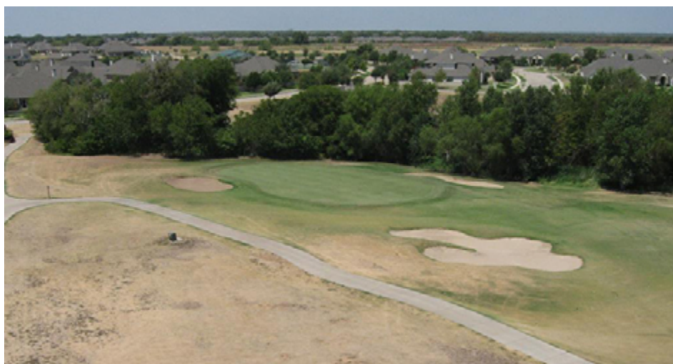
Putting green complexes typically encompass 4 to 6 percent of the total golf course area, and continuing to irrigate these areas helps to maintain acceptable playing quality while using relatively little water.